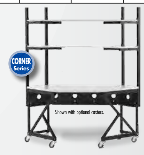
Includes two upper shelves.

Kendall Howard LAN Stations/Workbenches ship flat in completely enclosed crates to ensure that your products make it safely to your door.